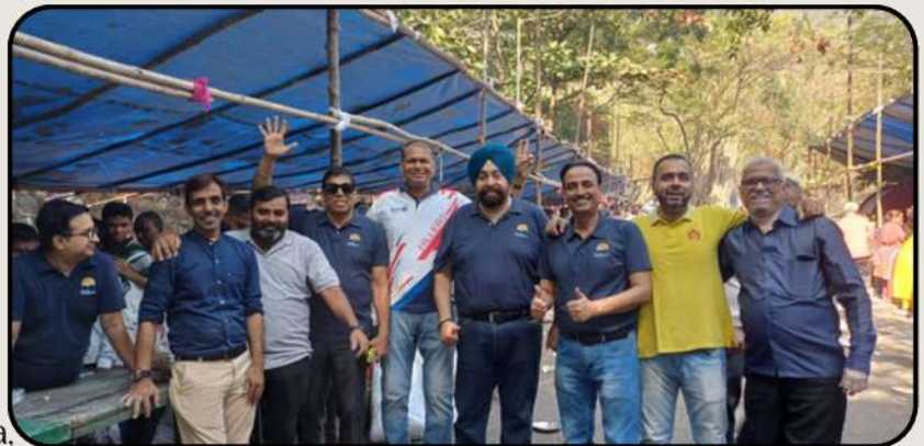
Hillarsat Annapurna in Mouni Amavasya